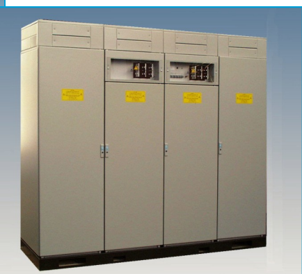
NTS 25000M - 50 50V / 5000A