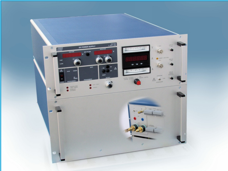
NTS 720 - 8 mod. 8V / 90A customer specific design for high temperature super conductor