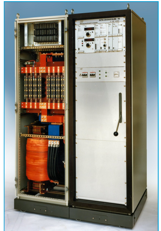
NTS 20000M - 10 10V / 2000A