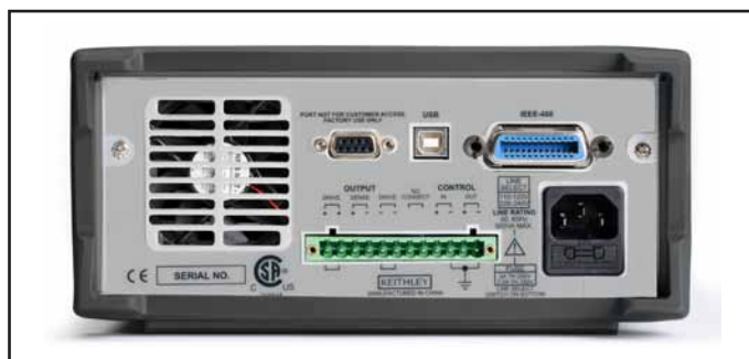
Series 2200 rear panel.

1.888.KEITHLEY (U.S. only) www.keithley.com